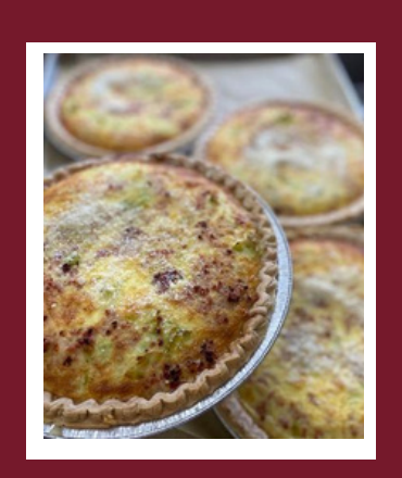
Culinary Institute of America-trained

Closed for Vacation July 2-10 Our store will open July 7th for July 15th Pick Up